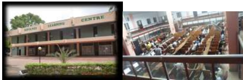
Frontage and Interior view of the Distance Learning Centre

The Distance Learning Centre of the Ahmadu Bello University (see pictures) is currently located in the Ahmadu Coomassie Building (former ABU Bookshop) adjacent the Senate Building on the Main Campus.