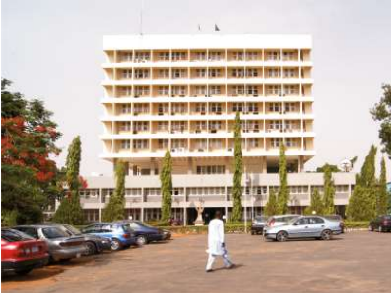
The University Senate building